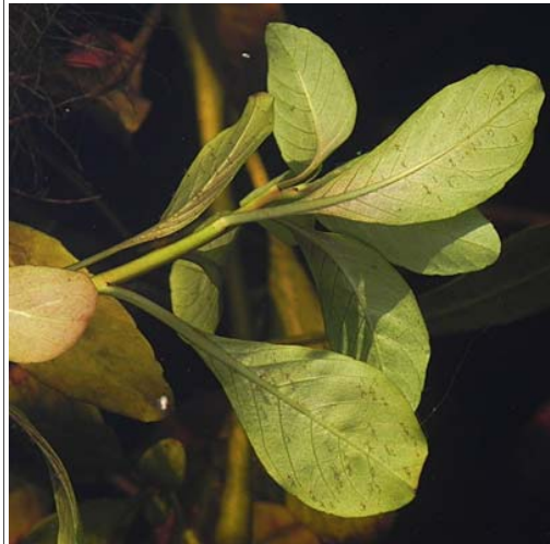
leaves alternate, leaf decurrent along petiole