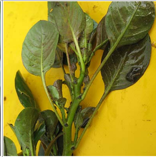
leaf bracteoles roundish, swollen