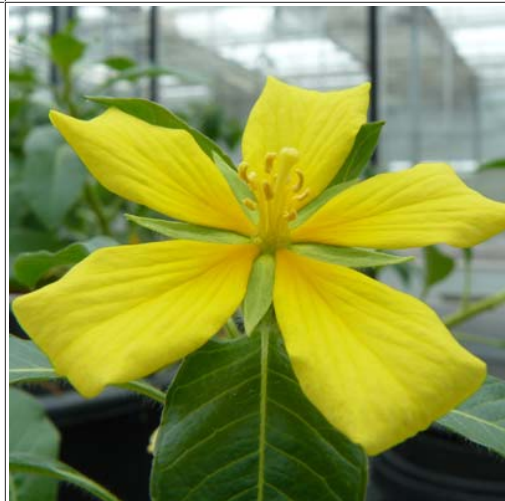
flower with 5 sepals and 5 large (>0.7 cm) yellow petals