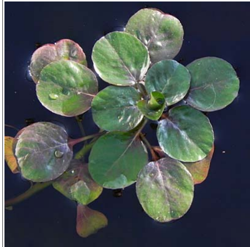
leaves alternate, lamina and petiole clearly defined