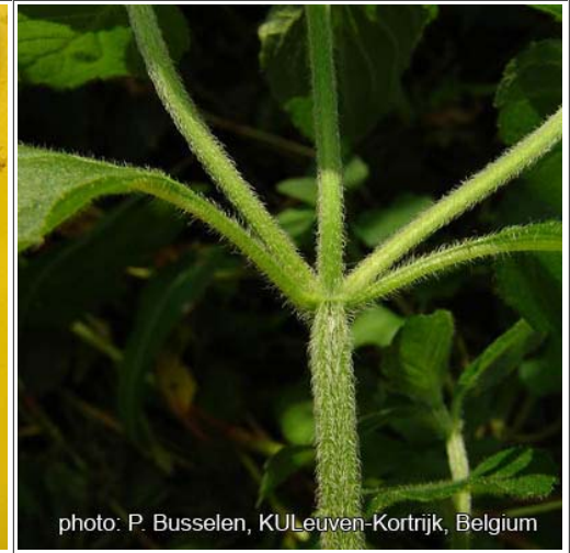
leaf bracteoles absent