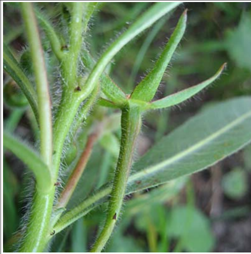
leaf bracteoles triangular, flat