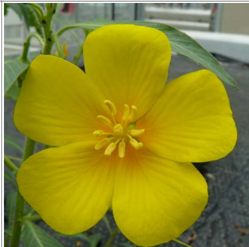
flower with 5 sepals and 5 large (>1.5 cm) yellow petals