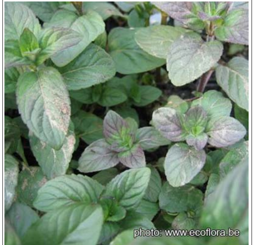
leaves opposite, distinctly hairy