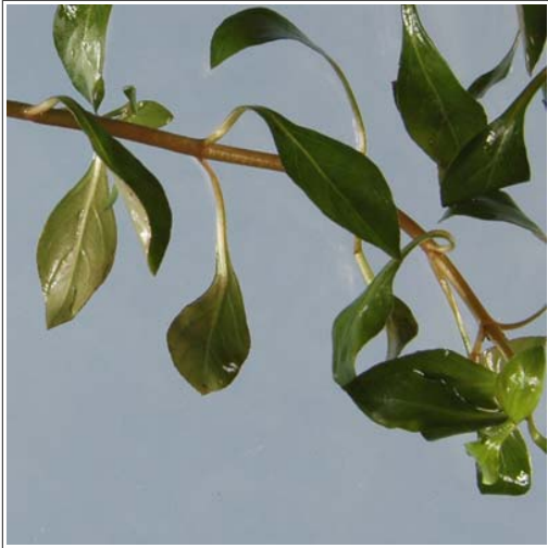
leaf bracteoles inconspicuous